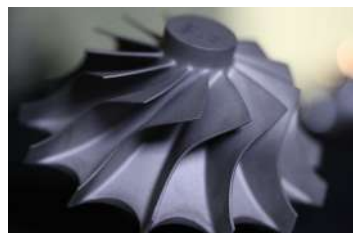
2. Turbine wheel