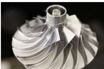
1. Compressor wheel