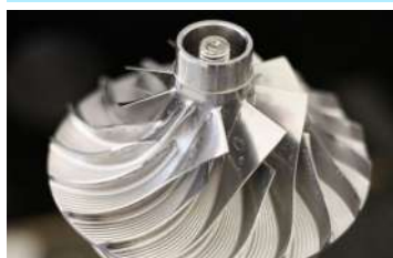
1. Compressor wheel