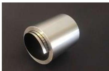
3. Air bearing