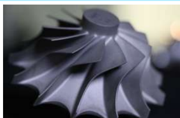
2. Turbine wheel